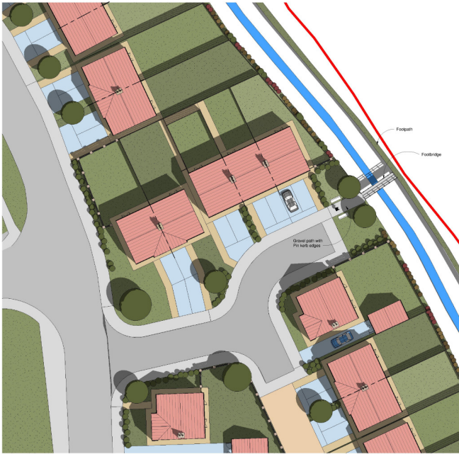
1 Site Plan - Bridge Plan 1:200

Notes Footbridge design to be by specialist to approval of North Yorkshire County Council (NTCC) Public Rights of Way Department (PRoW). Gravel path to be graded to design of footbridge as required.